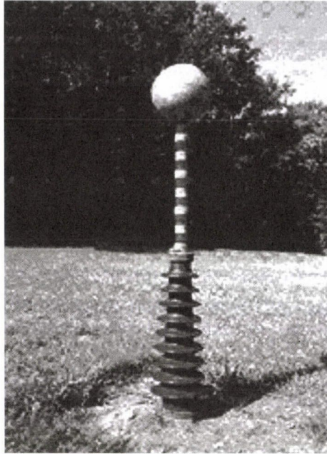
Fig. 1. Ball-antenna for the measurement of the vertical electric field component of Schumann resonances

The hourly averages of the peak-frequencies and the amplitudes for the first three modes and SR transients for selected time periods (international campaigns) are available (e-mail: satori@ggki.hu). Figure 1 shows the ball-antenna for the measurement of the vertical electric field component. Figure 2, as example, exhibits the daily frequency and amplitude variations of the first three modes characteristic for a winter month. Figure 3 depicts a SR-transient.